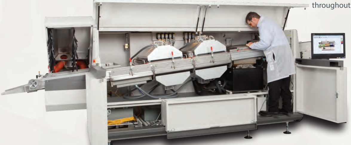
View from front with all doors and hoods open.